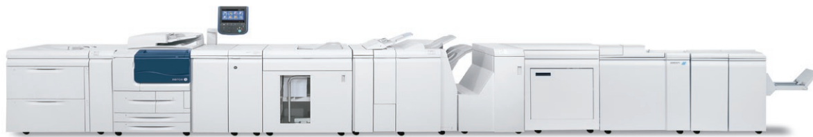
Xerox® D110/D125 Copier/Printer shown with Plockmatic Pro30™ Booklet Maker

For more information on the Plockmatic Pro30™ Booklet Maker with Plockmatic RCT30, contact your Xerox representative, call 1-800-ASK-XEROX or visit us at www.xerox.com .