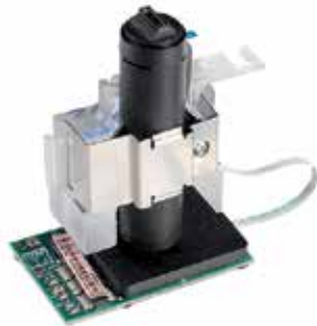
HP Optical Media Advance Sensor (OMAS)

Turn orders in record time with the fastest 60-inch production printer for graphics. 6 Offer exceptional color and black-and-white prints on many substrates with 8 HP Vivid Photo Inks. Count on advanced color management features backed by HP reliability and easy operation.