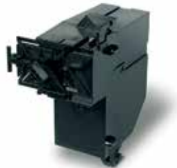
Spectrophotometer with i1 color technology from X-Rite