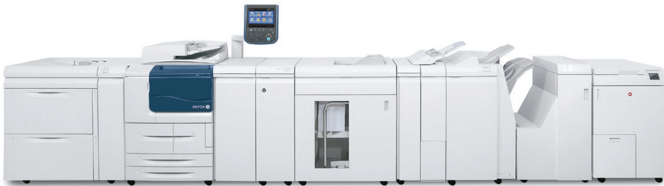
Xerox® D110/D125 Copier/Printer shown with GBC® eBinder 200™

For more information on the GBC® eBinder 200™, contact your Xerox representative, call 1-800-ASK-XEROX or visit us at www.xerox.com .